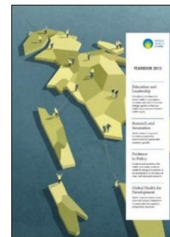
WHS Yearbook 2013

Previous Yearbooks have received various awards, including: