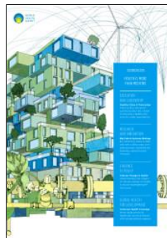
WHS Yearbook 2014