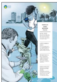
WHS Yearbook 2015

Circulation: 5,000 printed copies & more than 18,000 digital copies